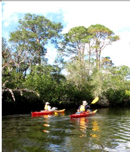
Upper Estero River

Throughout its history, Florida has welcomed pioneers of all kinds. Cyrus Reed Teed was probably the most unusual, bringing followers to Estero in 1894 to build the "New Jerusalem" for his new faith, Koreshanity. The colony, known as the Koreshan Unity, believed that the entire universe existed within a giant, hollow sphere. The colony began fading after Teed's death in 1908, and in 1961 the last four members deeded the land to the state. What remains of their once vibrant community are 11 beautifully maintained historic structures that date from 1882-1920 and landscaped grounds including unique ornamental exotic vegetation from throughout the world. Today, visitors can fish, picnic, boat, and hike where Teed's visionaries once lived and created their own utopia. Visitors can take self-guided tours of the settlement or a ranger-guided tour.