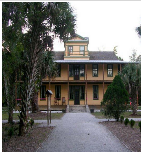
Koreshan State Historic Site Photos FWC